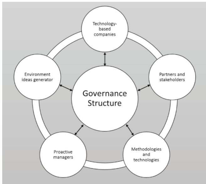
Figure 1. Critical success factors of INOVAPARQ governance structure

On Figure 1, the factors represent the search view that will guide the process of scientific research on the INOVAPARQ.